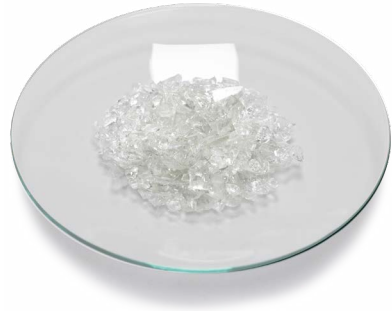
Particle size after milling